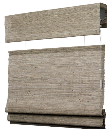
Top-Down Only with Newton

Size Limitation Min. width: 12" Max. width: 96" Max. length: over 152" contact H&F