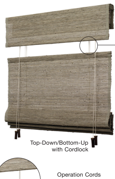
Top-Down/Bottom-Up with Cordlock