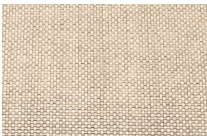
WL348 Hillcountry - Chapparral

Publication: Overland Journal Date: Fall 2020 Article: The Ryovan Project | p73-80 Product Shown: